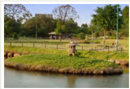
PL Deshpande Garden